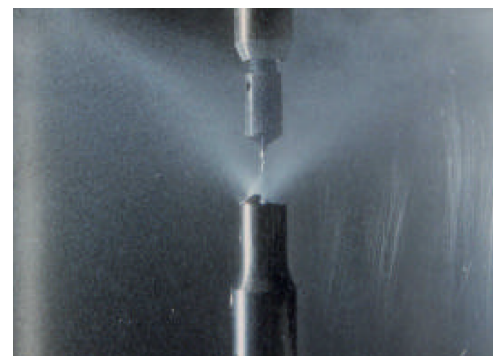
Ultrasonic Atomization of Low Melting Point Alloy and (top left) Gas Atomizer Close Coupled Nozzle

A unique course directed to practitioners and researchers on the principles and practice of powder manufacture by atomization of molten metals