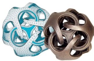
Powder for additive manufacturing