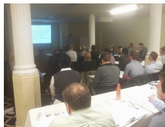
Lecture at the Britannia Hotel