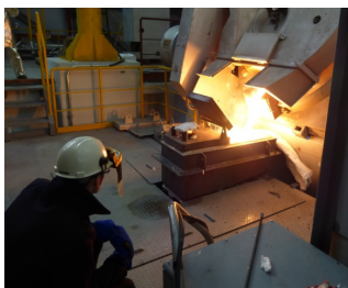
ASL iron powder atomizer