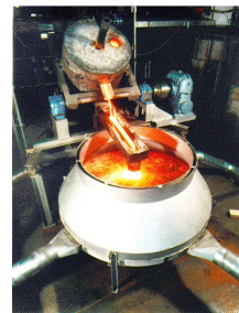
ASL rotary (water quenching)